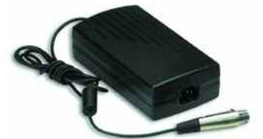
Optional DC converter with AC-DC power brick